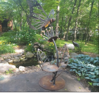
NW corner of Inches St & NB Gratiot