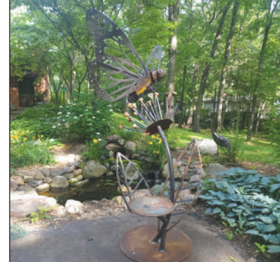
Butterfly on Milkweed