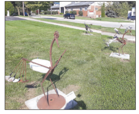
Golf Birds by Jonathan Bowling (Corner of SB Gratiot & Belleview)